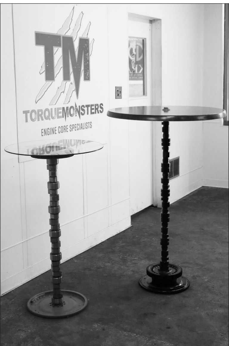
The Torque Monsters crew has experimented with building crankshaft tables for unique gifts.